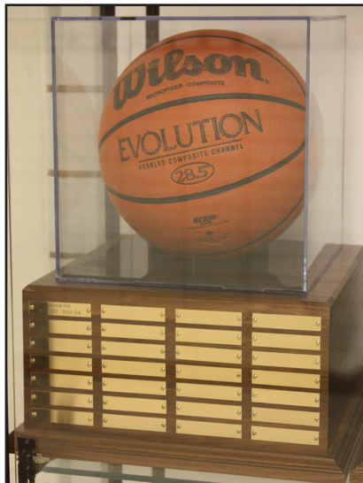
The traveling trophy awarded to team that wins the Niles West Basketball Jamboree on Dec. 5.

The Wolves will compete tomorrow at Wheeling High School in the Hersey Tournament.